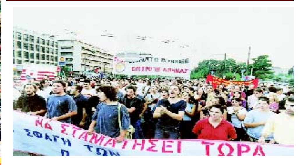
May 29. National Strike by PAME (All workers' militant front) in defence of the social insurance system. The sailors strikers defend their right to strike against the state and para-state oppression mechanisms.

This years' mobilizations and demonstrations organized by PAME are especially massive and militant. Thousands of workers demonstrate all around Greece, in defense of their rights. They also express their solidarity with the struggling people of Palestine, Cuba and Venezouela and denounce the aggression of the imperialists (US, NATO, EU) against the people.